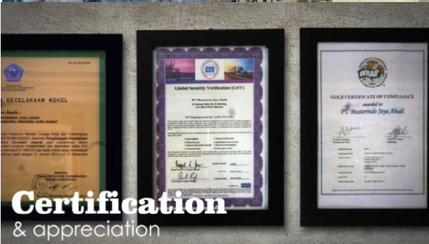
Certification & appreciation